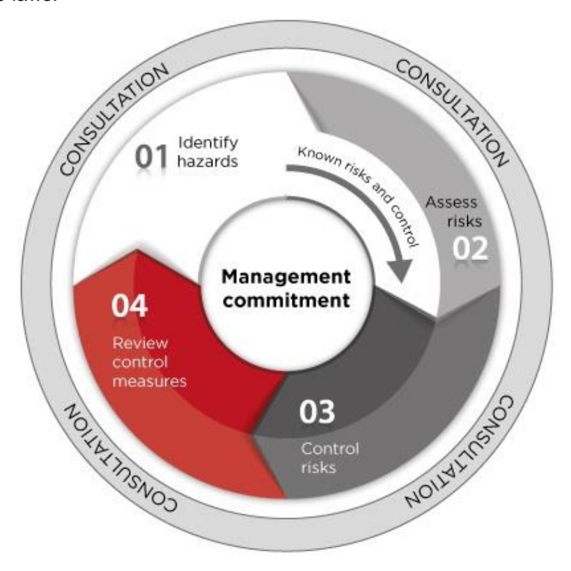
Figure 1 The risk management process

Further information is available in the Interpretive Guideline: The meaning of 'reasonably practicable'. The process of managing risk described in this Code will help you decide what is reasonably practicable in particular situations so that you can meet your duty of care under the WHS laws.